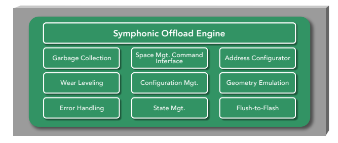
Symphonic is a combination of SSD firmware and software that enables systems to cooperatively perform Flash management

Upon system power failure, the RMS-250 switches to an auxiliary power mode provided by on-board ultracapacitors and data that is stored in volatile DRAM is transferred to persistent NAND memory by the Flush-to-Flash firmware. Once transferred to NAND memory, data is stored in the persistent storage and