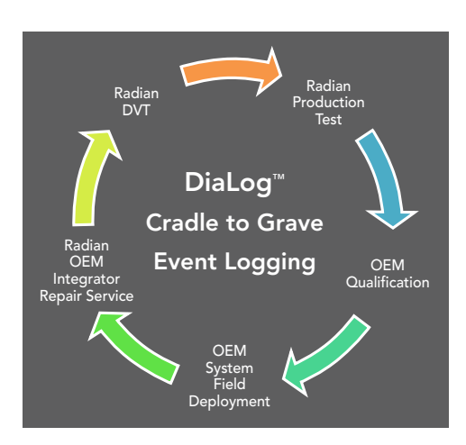
DiaLog provides continuous heart beat monitoring and life cycle management