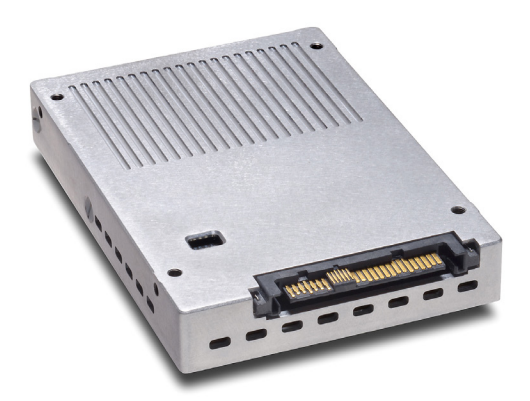
2.5" NVMe x4 NVRAM/Flash SSD